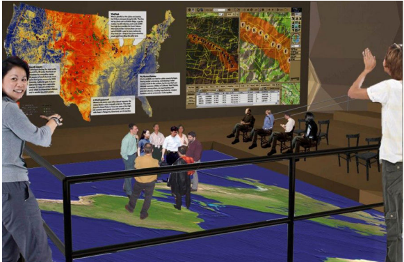
Artist renderings of the World Resources Simulation Center.

visualization and simulation technologies, users can experiment easily with a range of scenarios, creatively design answers to problems and find new commercial opportunities. It allows decision makers to decide quickly on policies, strategies and plans for making informed and sustainable choices benefiting humanity as a whole.